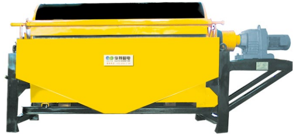
LI ^DBBHDBCHDCI G@E